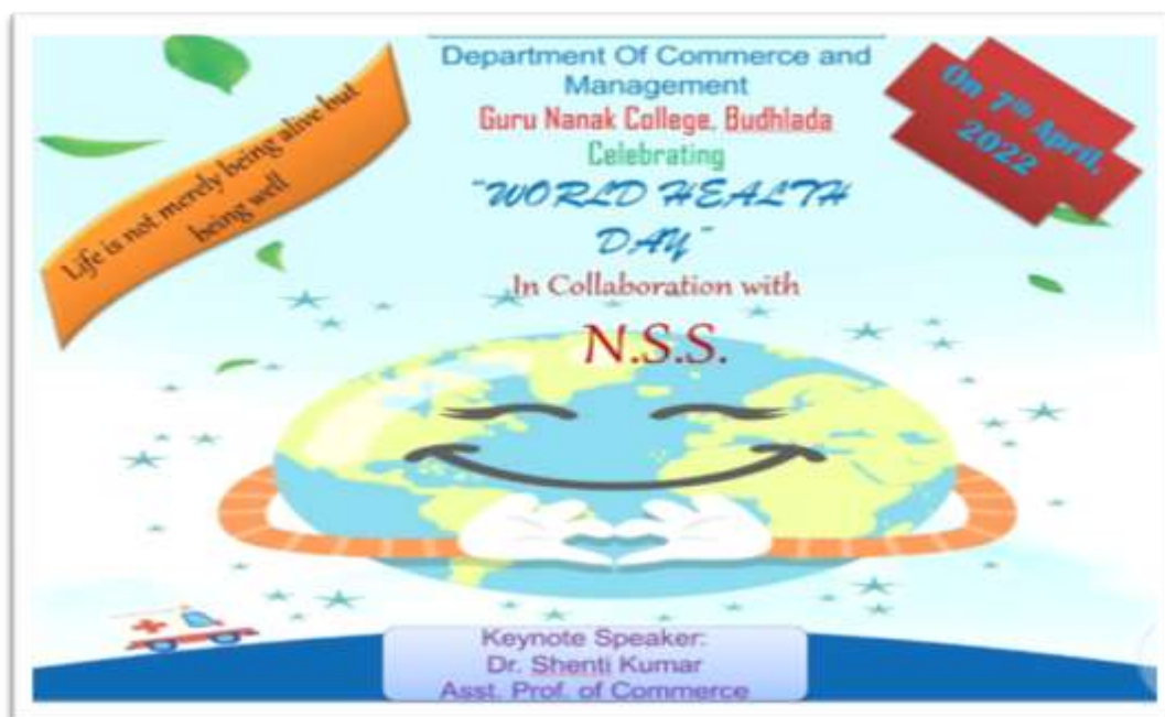
Figure 19 : Brochure of Guest lecture on World Health Day