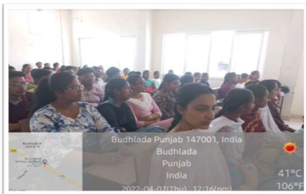
Figure 20: Students attending the lecture.