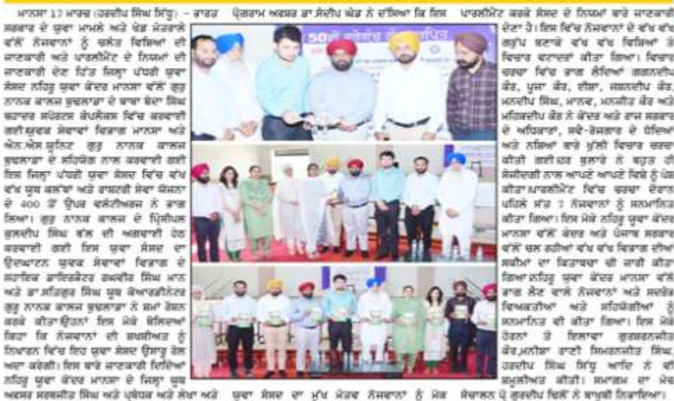
Figure 18: News coverage in Punjabi News Paper.

ਗੁਰੂ ਨਾਨਕ ਕਾਲਜ ਬੁਢਲਾਡਾ ਵਿਖੇ ਕਰਵਾਈ ਗਈ ਯੂਥ ਪਾਰਲੀਮੈਂਟ ਵਿੱਚ 400 ਤੋਂ ਉੱਪਰ ਲੜਕੇ/ਲੜਕੀਆਂ ਨੇ ਲਿਆ ਭਾਗ