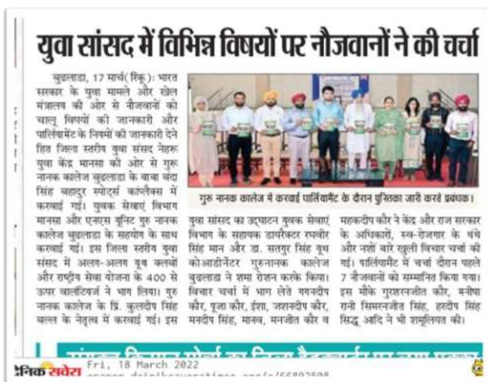
Figure 16: News Coverage in Hindi News Paper.

On 17 th March, 2021 Nehru Yuva Kender (Department of Youth Welfare and Sports, India) Mansa with the collaboration of NSS Cell, Guru Nanak College, Budhlada organised the District level Youth Parliament at Baba Banda Singh Bahadur Indoor Stadium, Guru Nanak College, Budhlada. The purpose of this event was to aware the students about the Indian Parliament rules and regulations. In this Youth Parliament around 400 students have participated and gave their views on various current topics like: Rights and Responsibilities of State and Centre government towards citizens, Self-Employment and Drug minance. First 7 student got positions and honoured with medals and trophies.