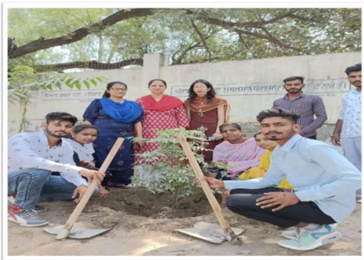
Figure 1: NSS Volunteers planted tree outside the college wall.