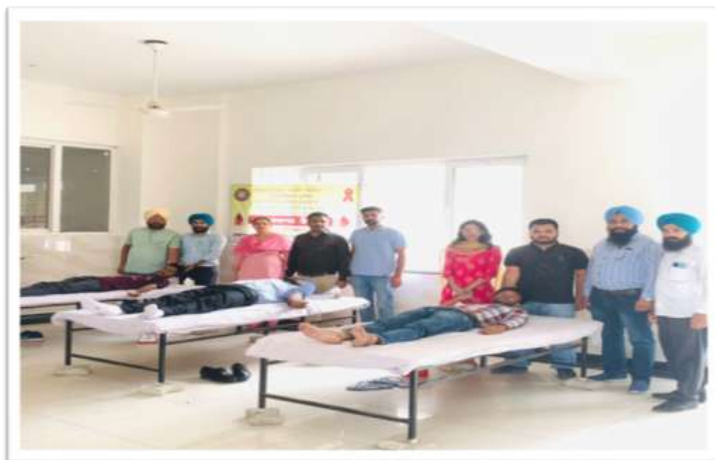
Figure 28: Volunteers donating blood during camp.