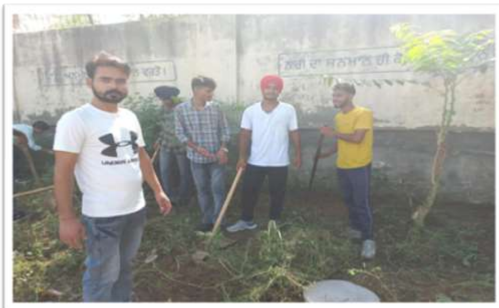
Figure 10: NSS Voluntaries doing cleanliness work.