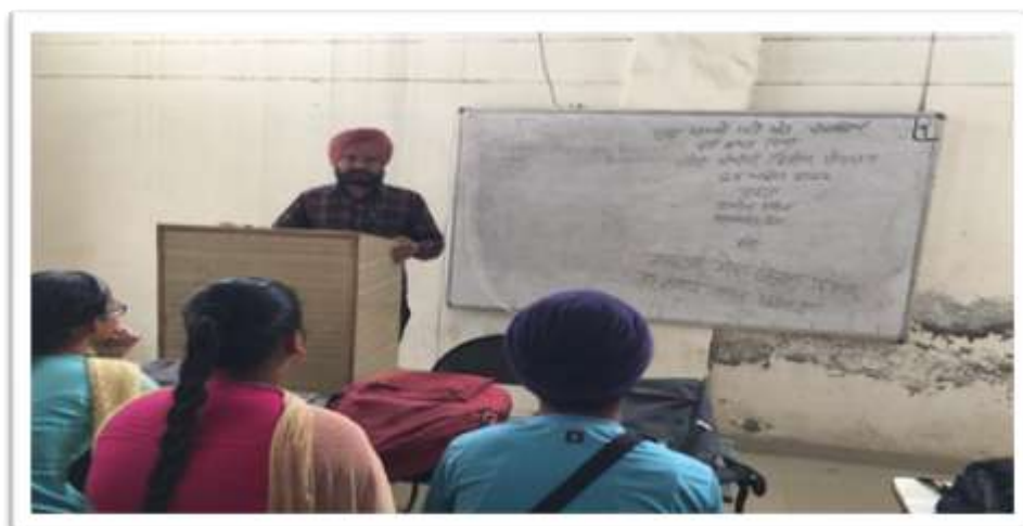
Figure 23: Guest Speaker addressing the students