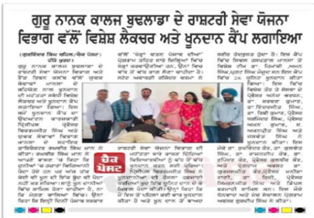
Figure 30: News Coverage of Blood Donation Camp.