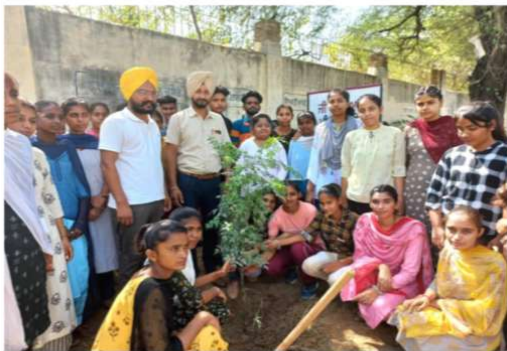
Figure 6: Tree Plantation dated 07/10/2021.