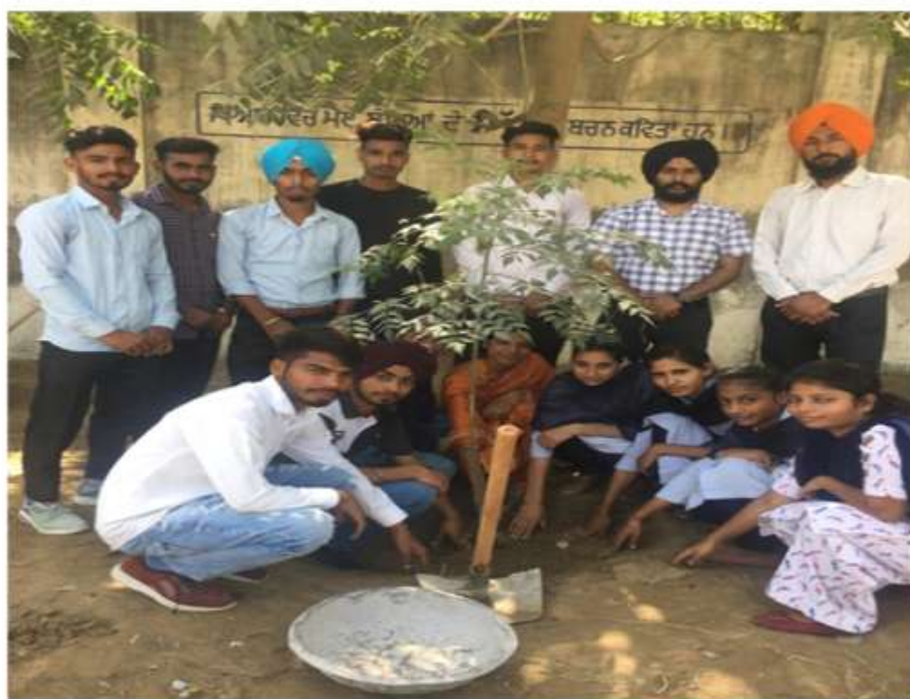
Figure 7: Tree Plantation on 18/10/2021.