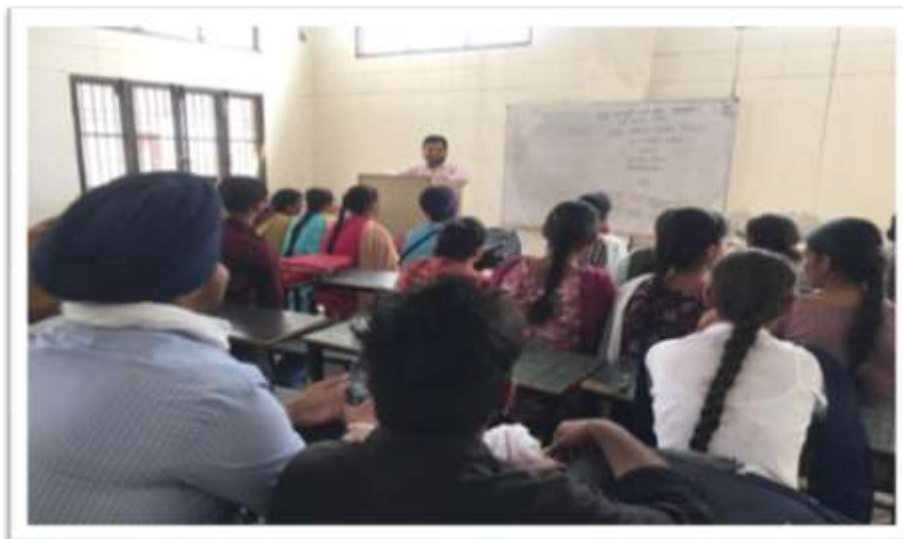
Figure 24: Students participation during the lecture