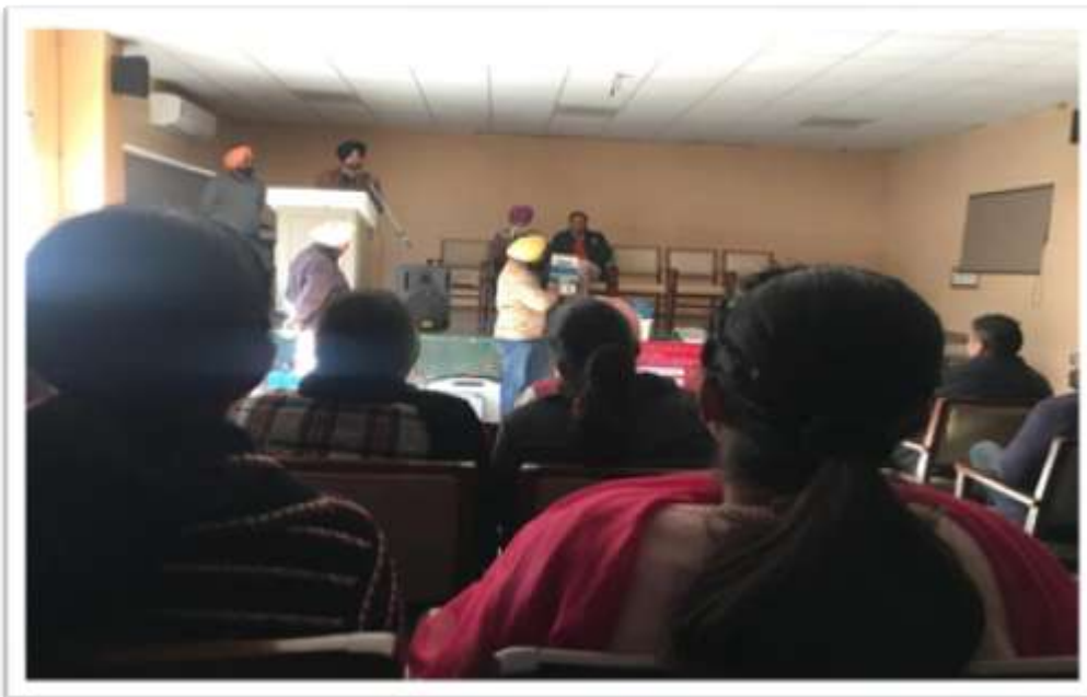
Figure 15: Officers giving information on EVM working.