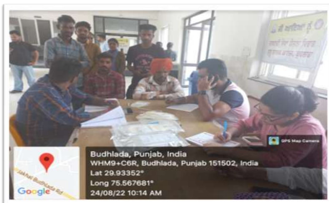
Figure 26: Blood Donation Registration Desk.