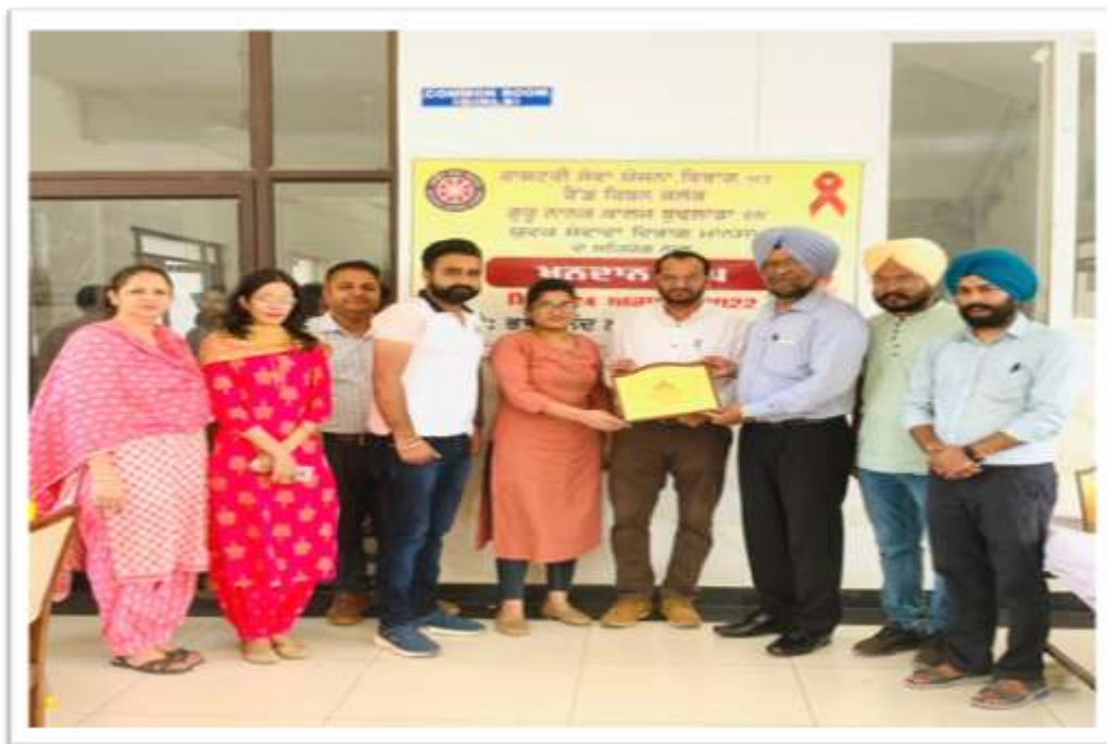
Figure 29: NSS cell honoring the Medical Team.