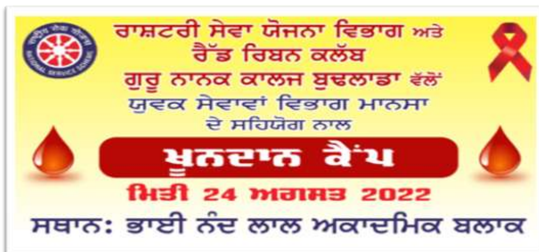
Figure 25: Brochure of the blood donation camp.