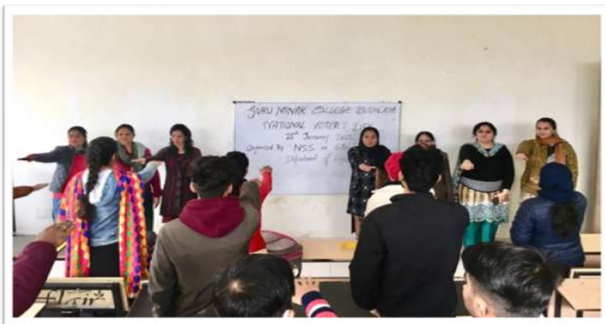
Figure 14: Students during Oath Ceremony.