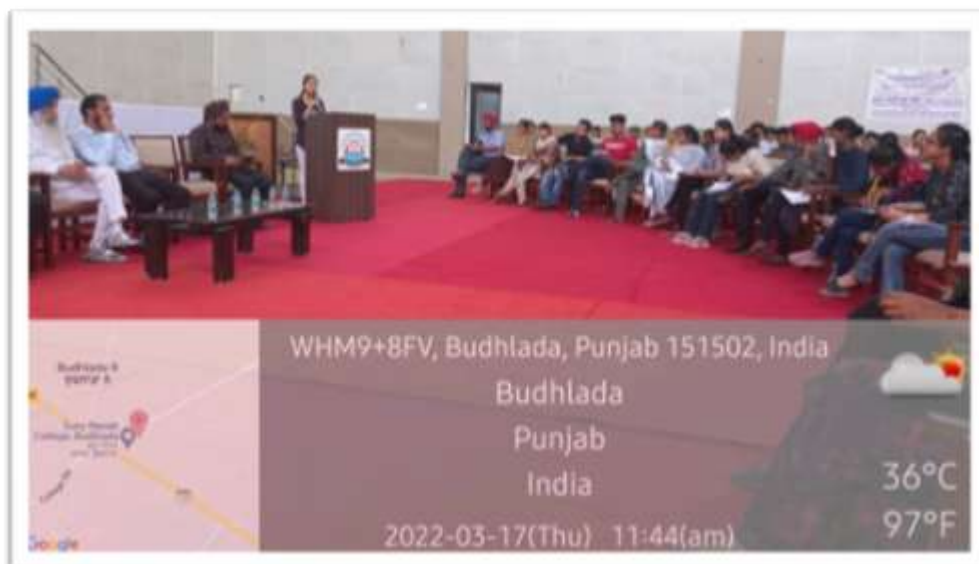
Figure 17: Students participation at Youth Parliament.