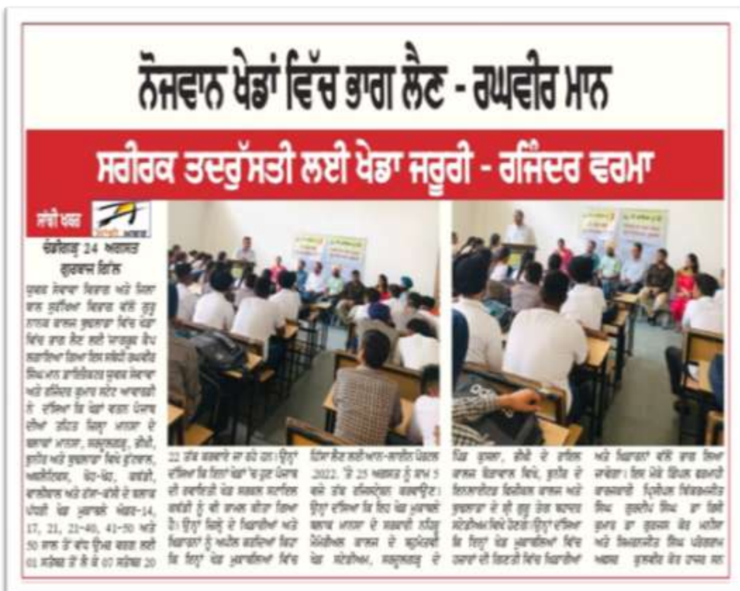
Figure 31: News coverage of the One Day Camp.