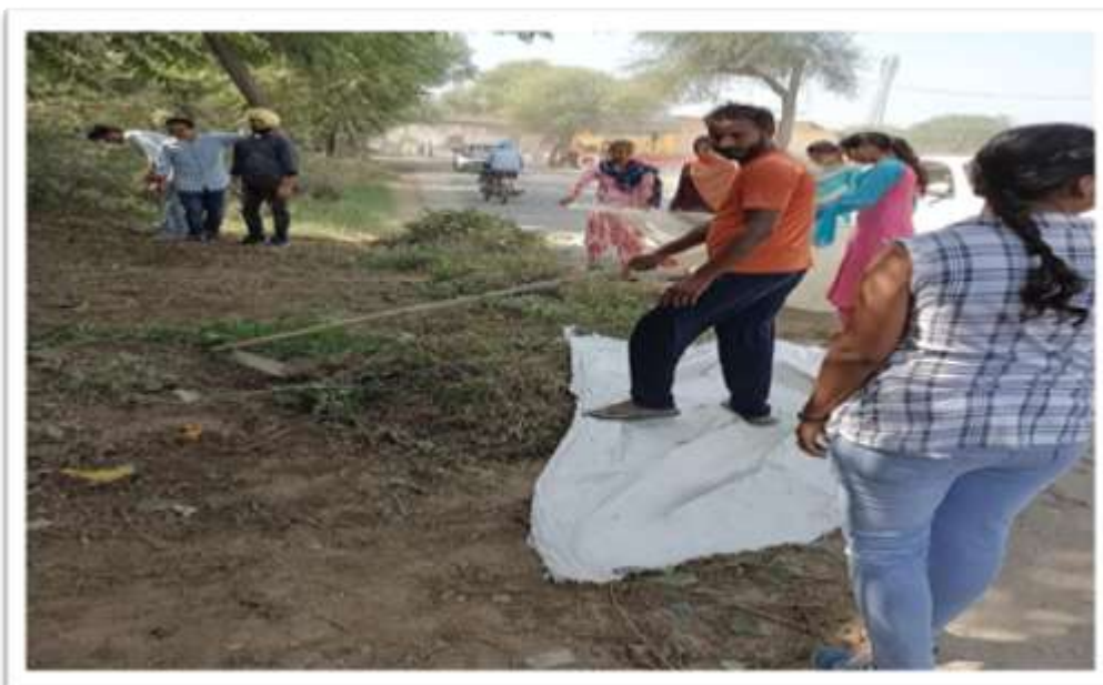
Figure 11: NSS Voluntaries doing College Beautification work at camp.