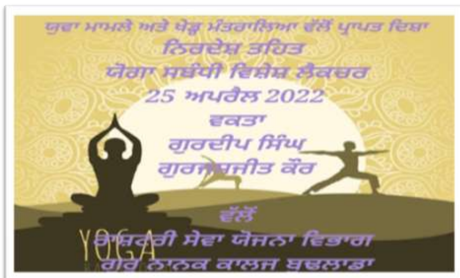
Figure 22: Yoga Day Guest Lecture Brochure