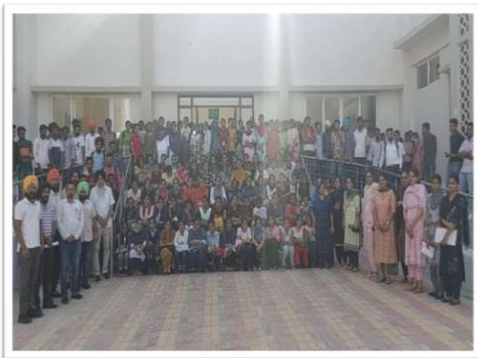
Figure 9: Voluntaries Group photo of Two Day NSS camp.