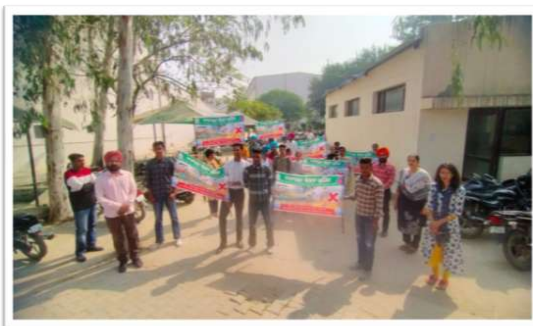
Figure 5: NSS Voluntaries during Rally.