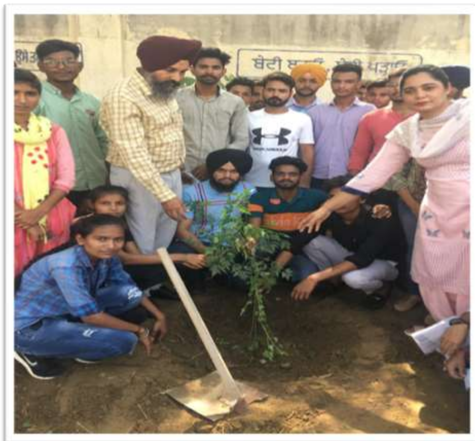
Figure 8: Tree Plantation Drive on 25th October, 2021.