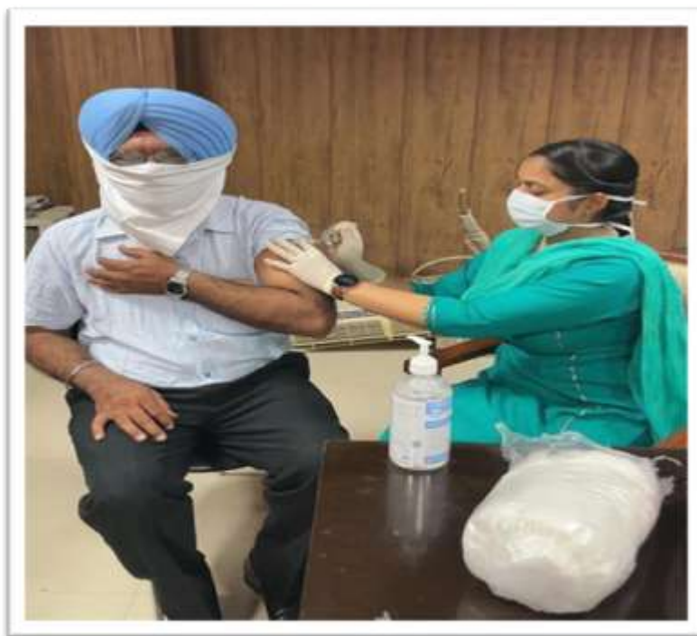
Figure 2: College teacher get himself vaccinated.