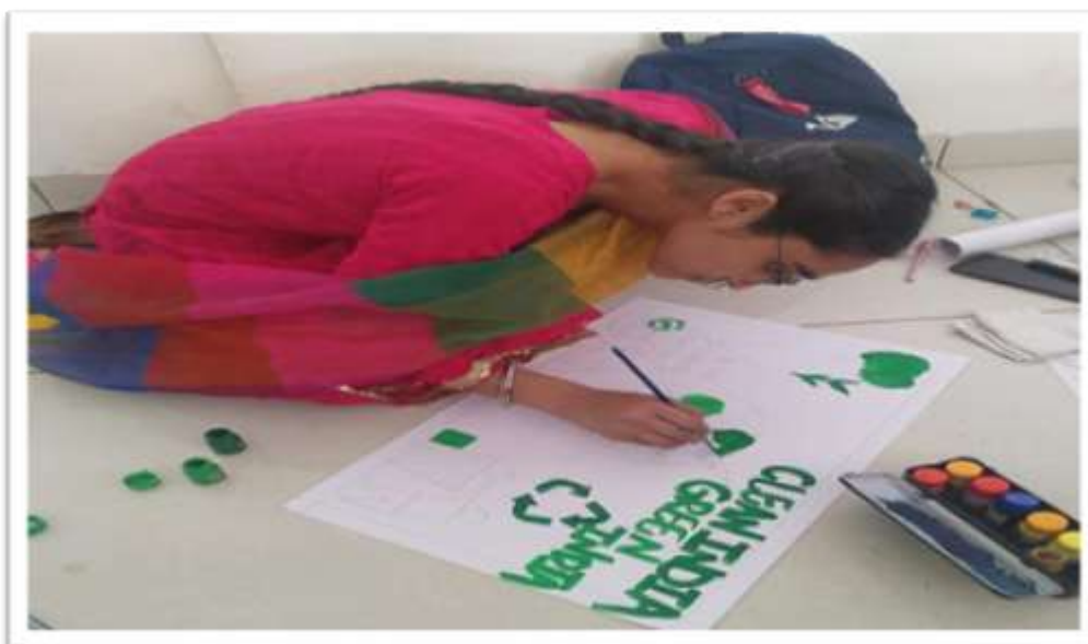
Figure 12: Students making a poster during competition

NSS Cell and Red Ribbon Club of the college organised poster making competition on 05/10/2021 related to the theme of Clean and Green India. Total 20 students were participated and made poster on clean and Green India theme.