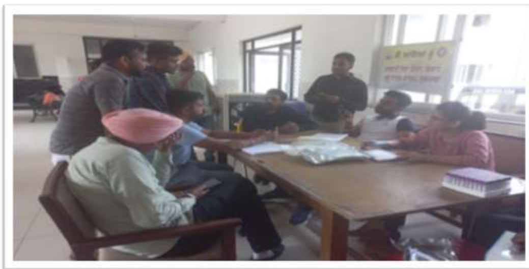
Figure 27: Students during registration for Blood Donation.