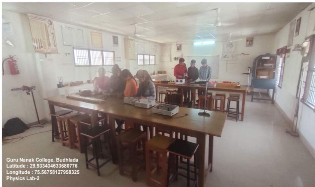
Guru Nanak College, Budhlada Latitude : 29.933434633680776 Longitude : 75.56758127958325 Physics Lab-2