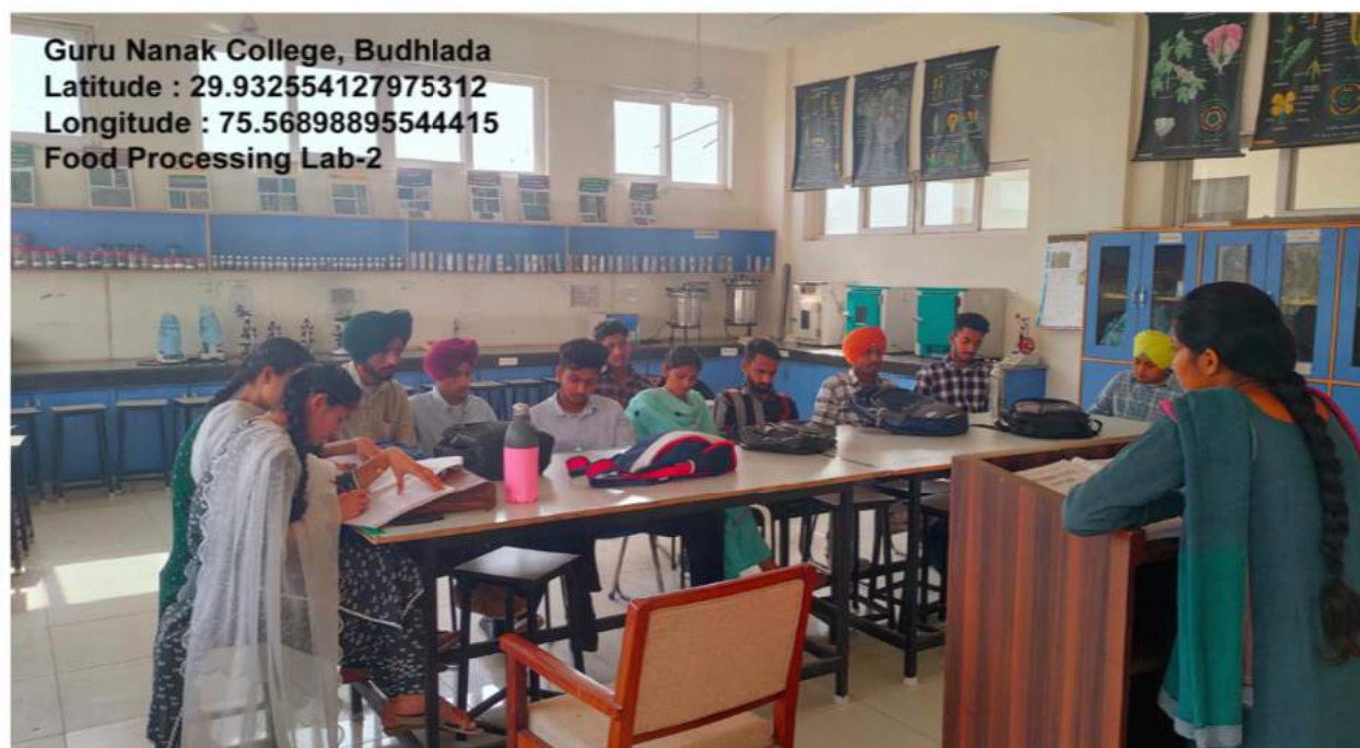
Guru Nanak College, Budhlada Latitude : 29.932554127975312 Longitude : 75.56898895544415 Food Processing Lab-2