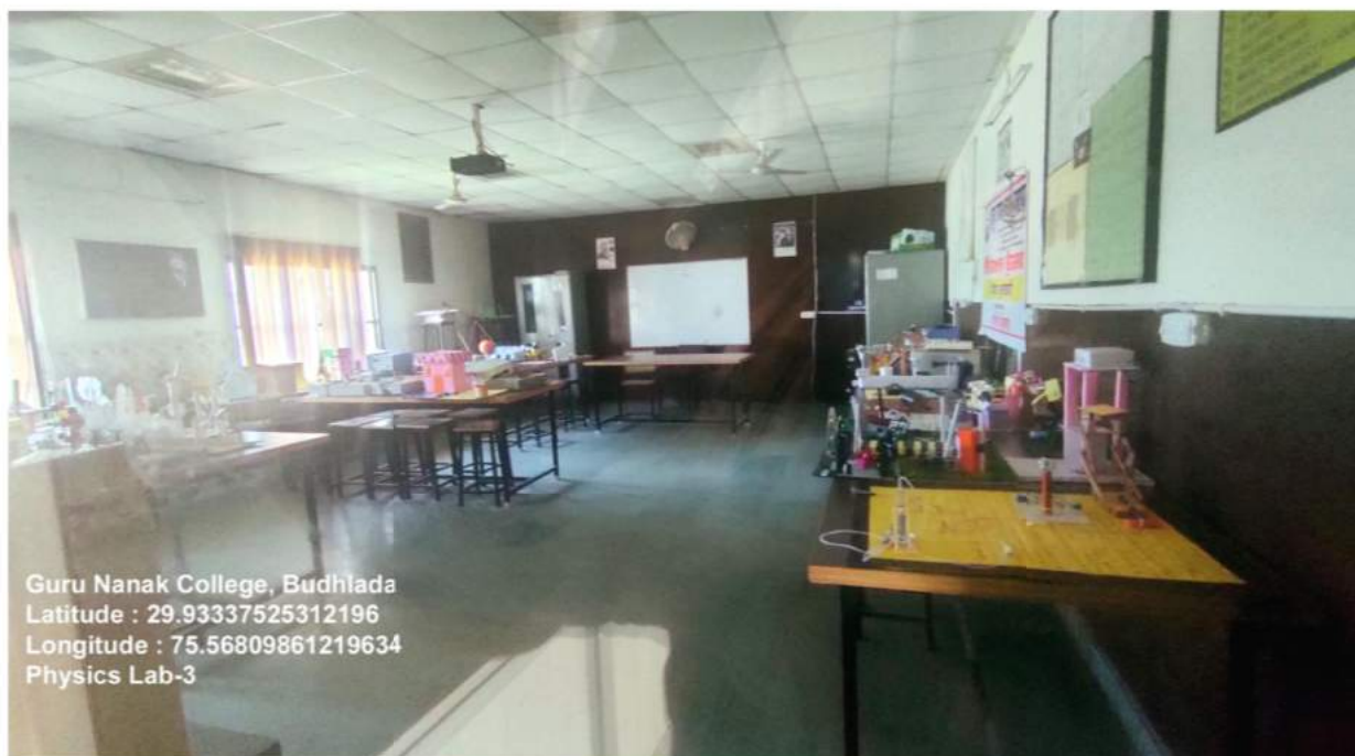
Guru Nanak College, Budhlada Latitude : 29.93337525312196 Longitude : 75.56809861219634 Physics Lab-3