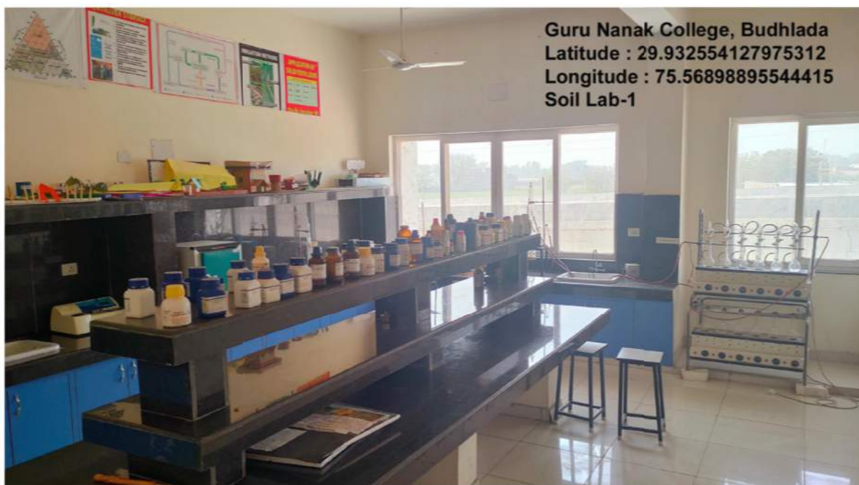
Guru Nanak College, Budhlada Latitude : 29.932554127975312 Longitude : 75.56898895544415 Soil Lab-1