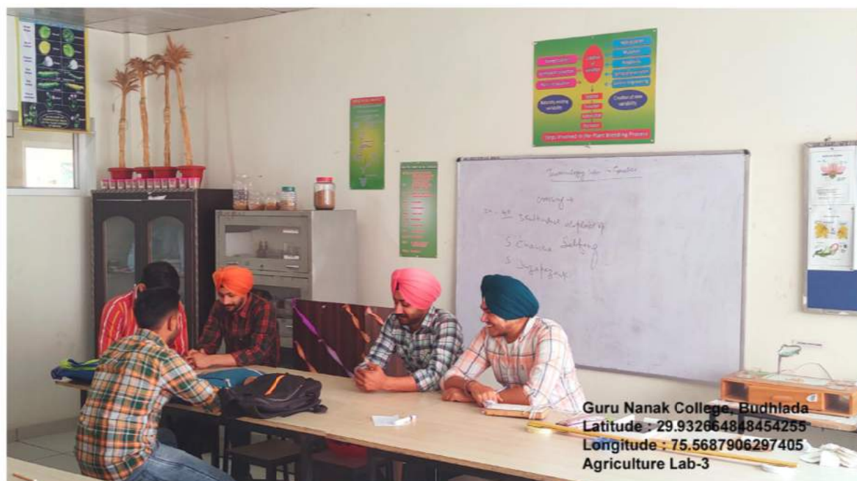
Guru Nanak College, Budhlada Latitude : 29.932664848454255 Longitude : 75.5687906297405 Agriculture Lab-3