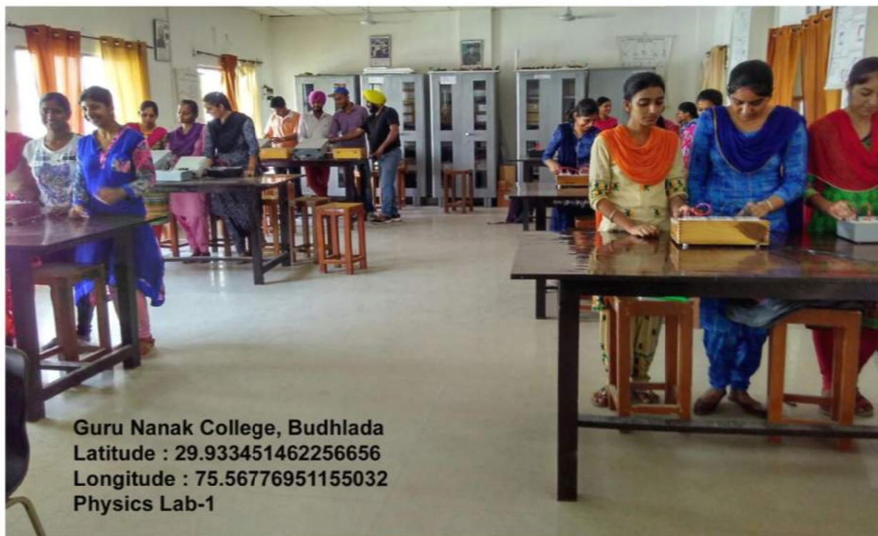
Guru Nanak College, Budhlada Latitude : 29.933451462256656 Longitude : 75.56776951155032 Physics Lab-1