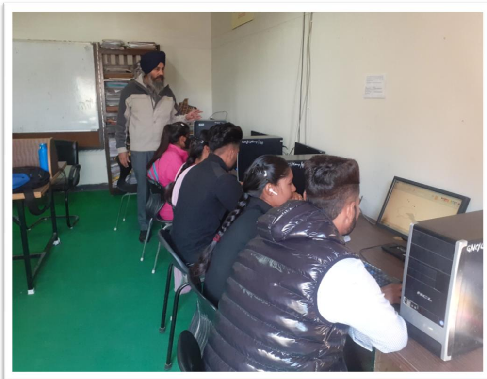
Students searching various e-journals in Research & Information Centre