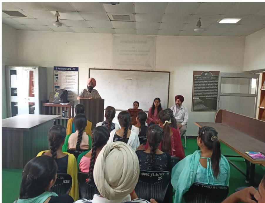
Lecture on Research Methodology