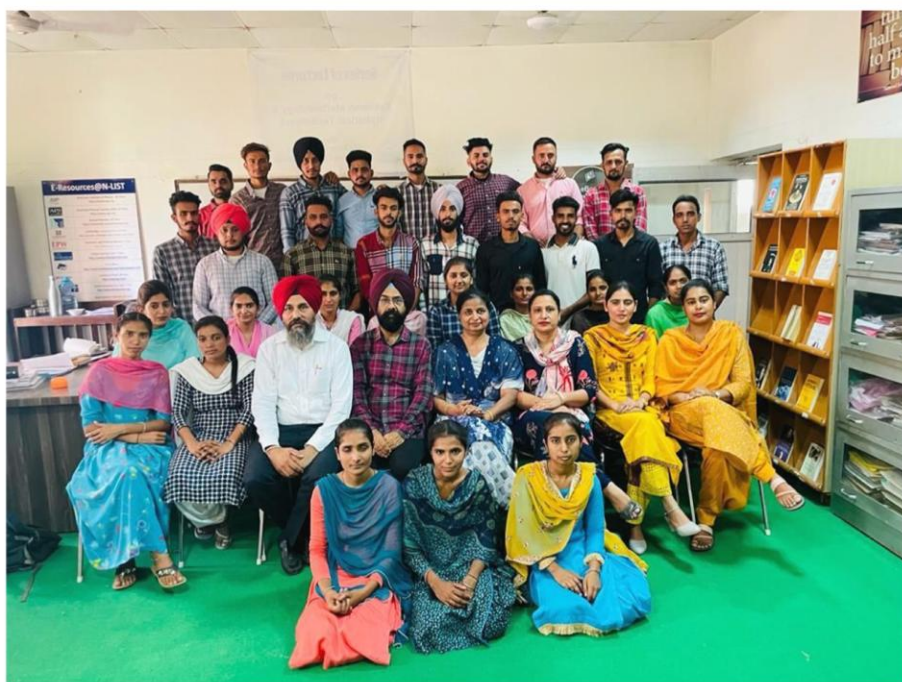
Students @ Research and Information Centre